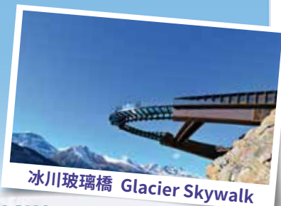
冰川玻璃橋 Glacier Skywalk