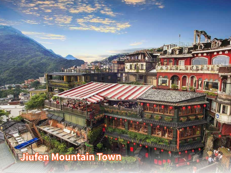
Jiufen Mountain Town

cuisine for lunch. Later, proceed to Rainbow Military Community, filled with many colorful paintings on the walls of houses. After, stop at Taichung Opera House, designed by Japanese architect Ito Kazuo, who was awarded the Pritzker Prize. The opera house is an astonishing architecture in the city. In the evening, go to Fengjia Night Market to enjoy the delicious Taiwanese snacks from the night market. Fengjia Night Market is the largest and one of the most famous sightseeing night markets in Taiwan. Dinner is on own arrangement today.