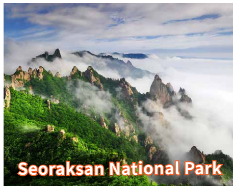
Seoraksan National Park