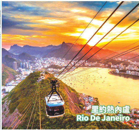
里約熱內盧 Rio De Janeiro

早餐後前往遊覽世界最著名的【 海灘 Copacabana 】，再前往外觀稱可以容納 20 萬人的世界最大的足球場【 馬拉卡納球場 】，後前往【 塞勒隆台階 】。從 1990 年開始，智利藝術家喬治塞勒隆用從 60 個國家蒐集來的五顏六色的瓷磚、陶片和鏡子鋪成了一條 250 級的台階，這個室外階梯連接著里約熱內盧的拉帕和聖特雷區。這座台階是來到里約非常著名的攝影景點，美國國家地理頻道、花花公子雜誌，還有許多著名音樂人如 U2、Snoop Dogg