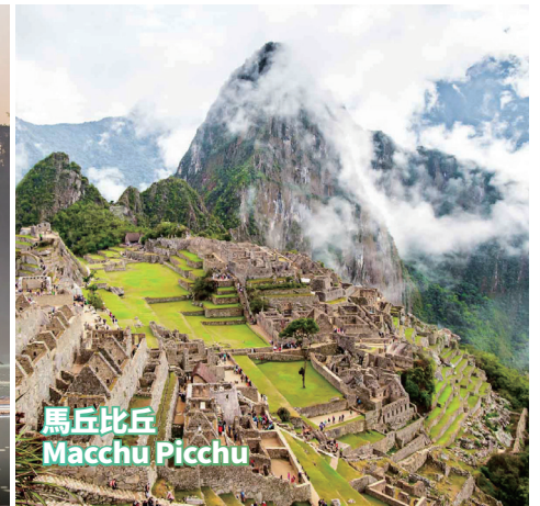
馬丘比丘 Macchu Picchu