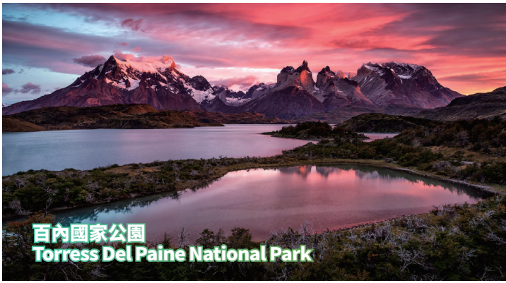
百內國家公園 Torres Del Paine National Park