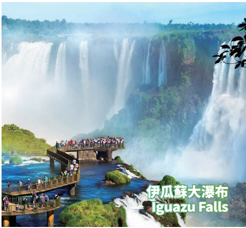
伊瓜蘇大瀑布 Iguazu Falls

East to West. A few kilometres before its junction with the Paraná River it forms one of the most splendid natural beauties of the world: Iguazu Falls. Over 2.7km long and an average flow of 1.750 m 3 /s, this wonder is located in a very special place: the contrast between the green of the vegetation and the dark colour of the basalt rocks with whirling waters plunging from a 72m high cliff is magical. At Iguazu there are 275 falls in all, some over 80m in height, making these cataracts wider than Victoria Falls and higher than Niagara! It should come as no surprise that UNESCO declared the region a World Heritage Site in 1986. Visit Hito Tres Fronteras, you will see the three counties at the same time.