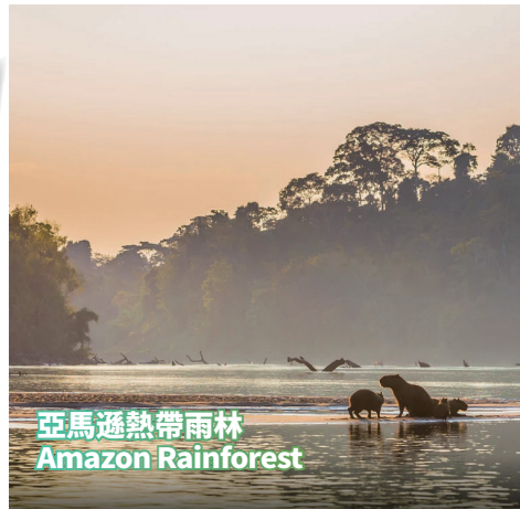
亞馬遜熱帶雨林 Amazon Rainforest