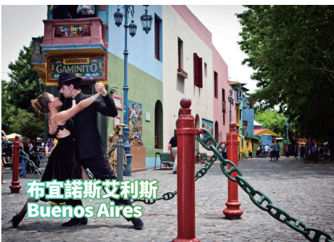
布宜諾斯艾利斯 Buenos Aires