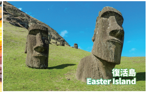
復活島 Easter Island

飛機上，次日抵達澳洲，結束 25 天南美之旅。On the plane, next day arrive in Australia, journey ends.