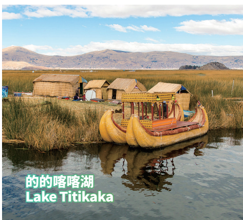
的的喀喀湖 Lake Titikaka

Flight to Santiago de Chile, transit to hotel to have a rest.