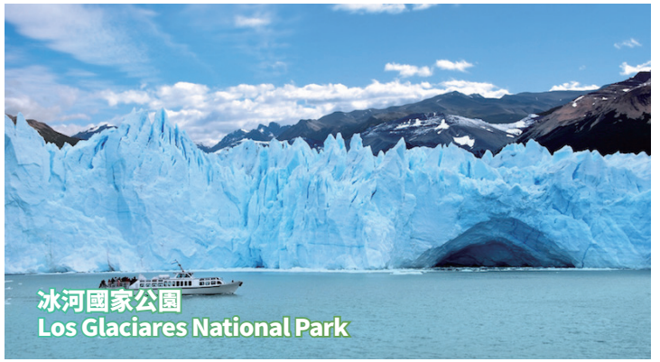
冰河國家公園 Los Glaciares National Park