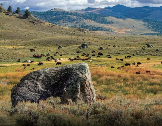
黃石國家公園 Yellowstone National Park

外桃源，蒙大拿州著名度假勝地【Big Sky】，這裡風景可以媲美黃石公園，甚至有更多的野生動物！