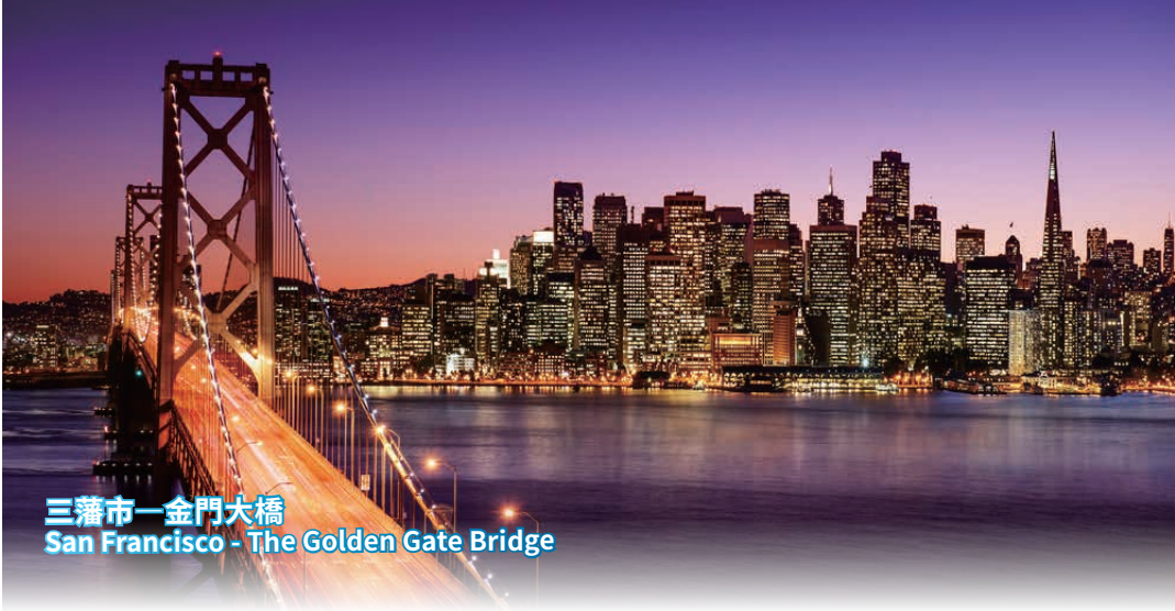
三藩市一金門大橋 San Francisco - The Golden Gate Bridge

早上前往參觀【伯克利大學】，伯校師生拿過 72 個諾貝爾獎，校園古色古香，還可遠眺金門大橋和金門海峽，是聞名世界的一流學府。隨後驅車前往三面環海，由 50 多個山丘組成，三面環海的【三藩市】。參觀美國西岸的標誌性橋樑，被稱為“不可能的大橋”的【金門大橋】；遊覽最熱鬧的【漁人碼頭】，更可【自費乘坐遊船欣賞