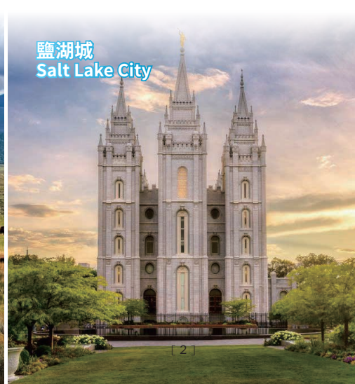
鹽湖城 Salt Lake City

早晨前往【猶他州州府山莊】，參觀【州政府大廈】，宛如宮殿般的政府大樓是美國少有的幾處不需要安檢即可入內參觀的州政府。採用了新古典主義建築的風格，