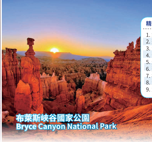
布萊斯峽谷國家公園 Bryce Canyon National Park

般的幽綠，河流於此在紅褐色的峽谷內急轉 360 度，切割出一個馬蹄狀的峽谷，馬蹄灣正是由此而得名。站在峭壁邊，沉醉於碧水藍天紅岩鉤織出的動人心魄的美。夜宿卡奈布。