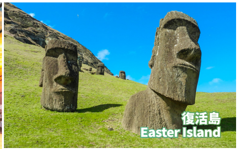
復活島 Easter Island

East to West. A few kilometres before its junction with the Paraná River it forms one of the most splendid natural beauties of the world: Iguazu Falls. Over 2.7km long and an average flow of 1.750 m 3 /s, this wonder is located in a very special place: the contrast between the green of the vegetation and the dark colour of the basalt rocks with whirling waters plunging from a 72m high cliff is magical. At Iguazu there are 275 falls in all, some over 80m in height, making these cataracts wider than Victoria Falls and higher than Niagara! It should come as no surprise that UNESCO declared the region a World Heritage Site in 1986. Visit Hito Tres Fronteras, you will see the three counties at the same time.