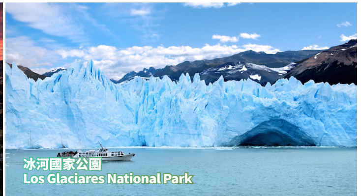
冰河國家公園 Los Glaciares National Park