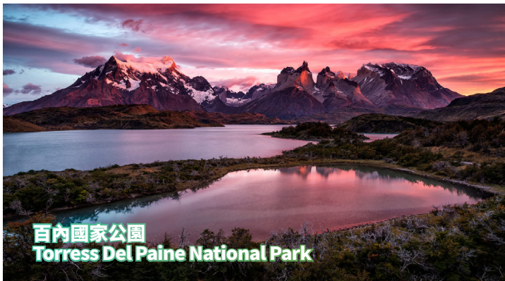
百內國家公園 Torres Del Paine National Park