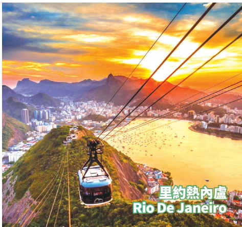
里約熱內盧 Rio De Janeiro