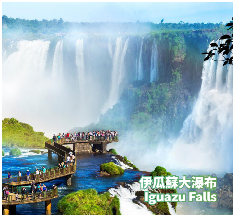
伊瓜蘇大瀑布 Iguazu Falls