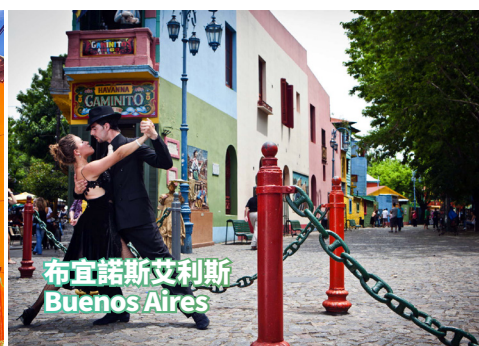
布宜諾斯艾利斯 Buenos Aires

Then embark onto the boat to cruise on the Lake of Argentina to enter to the famous Los Glaciares National Park followed by the Perito Moreno Glacier. The Perito Moreno Glacier is recognized as the advancing glacier in the world as it keep expanding approximately 100m each year. Evening flight to Buenos Aries, the capital of Argentina.