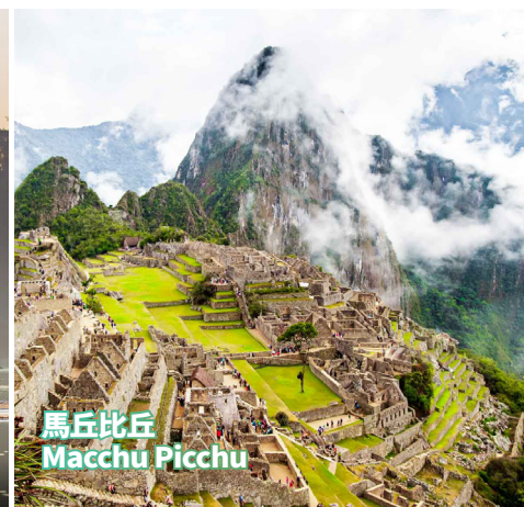
馬丘比丘 Machu Picchu