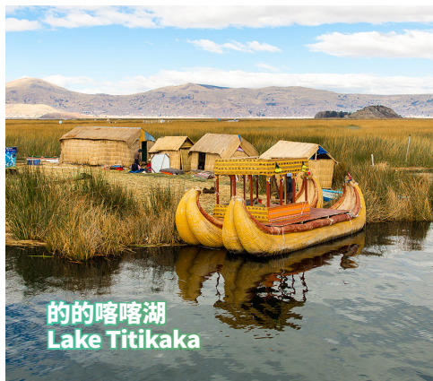
的的喀喀湖 Lake Titikaka

Flight to Santiago de Chile, transit to hotel to have a rest.